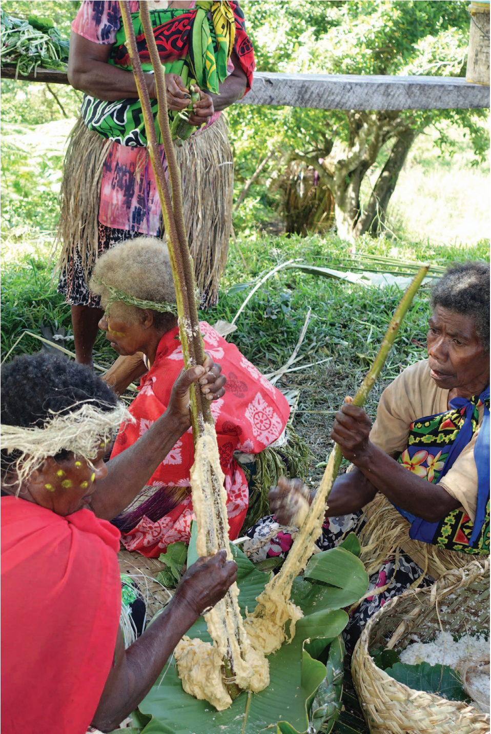
FIG. 2. Members of the “Imaki Slow Food Mamas” group from Tanna Island demonstrating how to grate bananas with the bases of the stipes of tree ferns ( Cyathaceae ) during a recent Kastom Skul (Custom School) designed to teach young people the traditional ways of living.