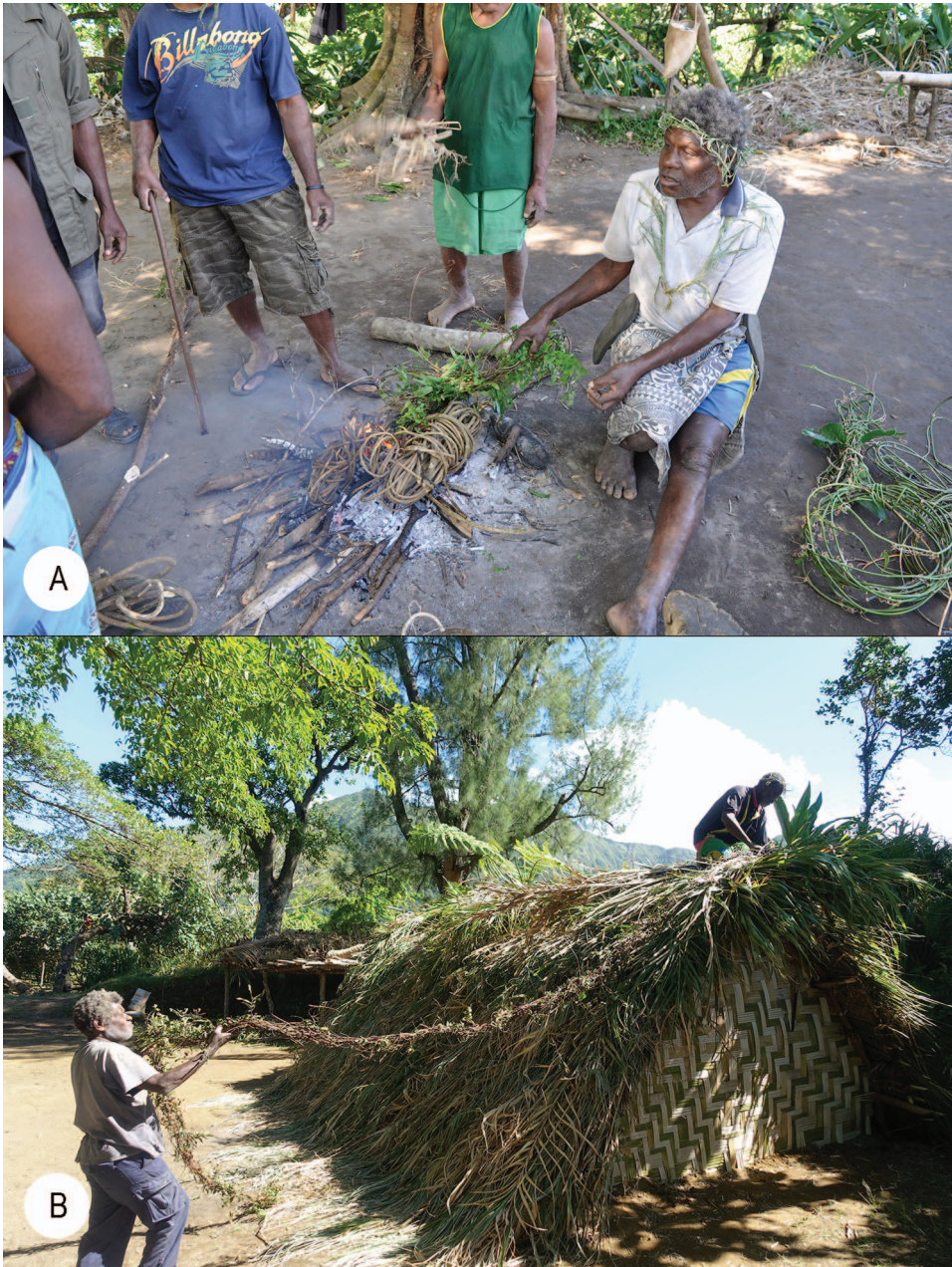
FIG. 6. The preparation and use of Lygodium reticulatum for constructing a traditional house in Tanna; both photos were shot in the Iatukwei nakamal in South Tanna. A. Local experts heat-treat the fern vines to make them supple, before use on the roof. B. Villagers use the tangled vines to secure the ridge of the thatched roof of a traditional house.