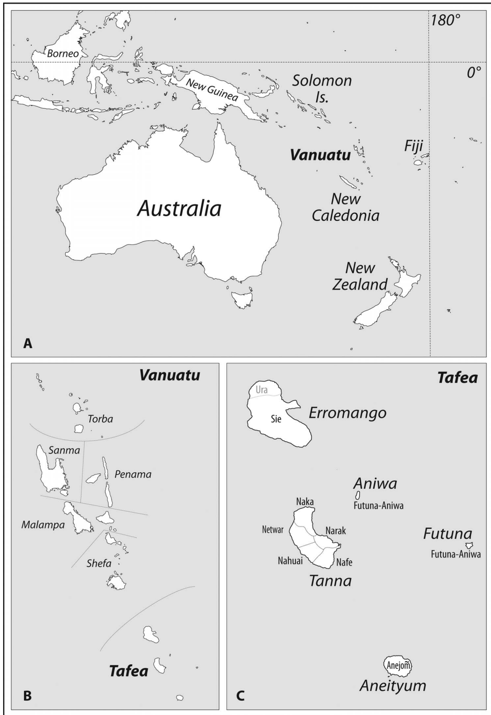
FIG. 1. A. Map showing location of Vanuatu relative to the other islands of Melanesia and Australia. B. Map showing delimitations of Vanuatu's six provinces, including the southernmost of